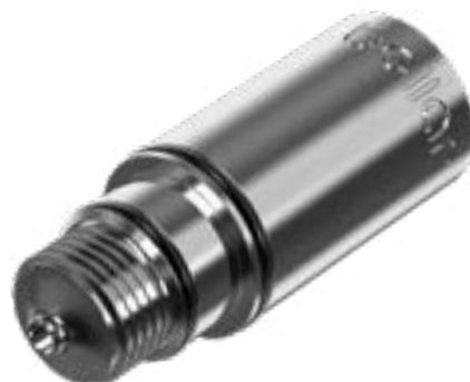
Body isometric view

Caution: Do not introduce any types of liquid inside the system or autoclave.