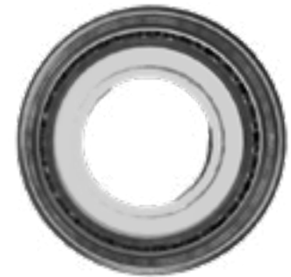
Compatible with most membrane needle cartridges on the market