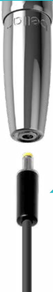
1 Plug the RCA cord into the Xion S RCA connector