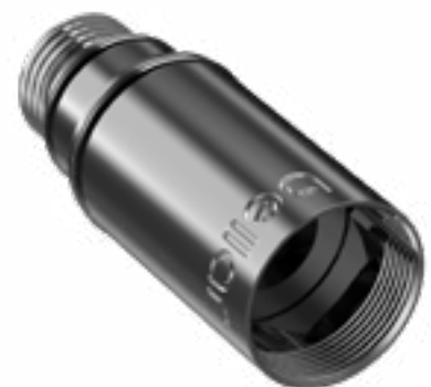
Body posterior view