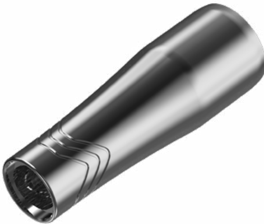
Autoclavable Ergonomic Grip design