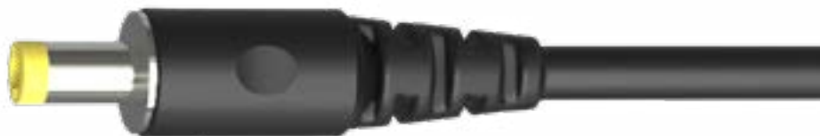
AIR Mini DC Cord

This connecting terminal is compatible with the Darklab Air DC Cord. For consistent connection and machine longevity, use the enclosed AIR Mini DC cord.