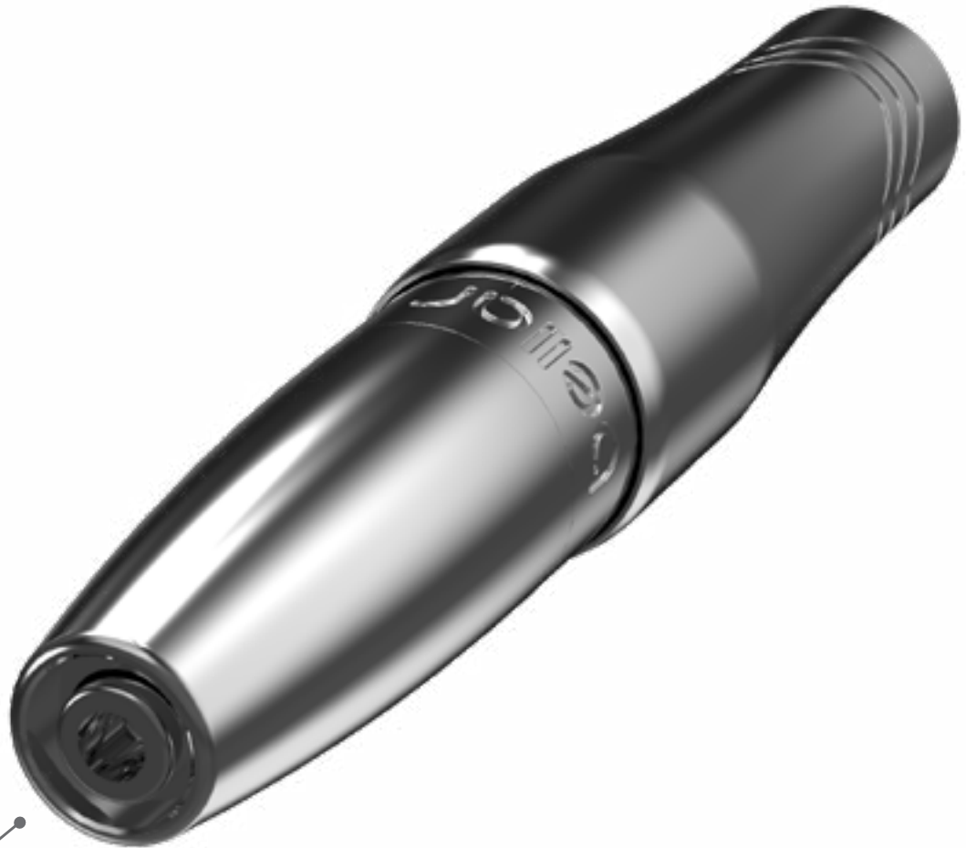
AIR Mini DC Connector